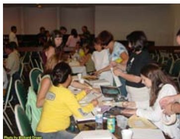
A general teacher workshop was held the following day for over one hundred educators