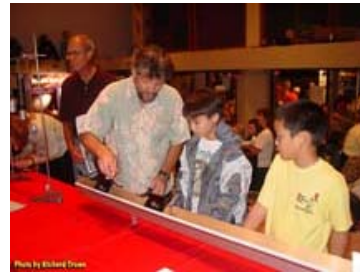
UH Hilo Physics and Astronomy exhibit featured an air-track demonstrating collisions