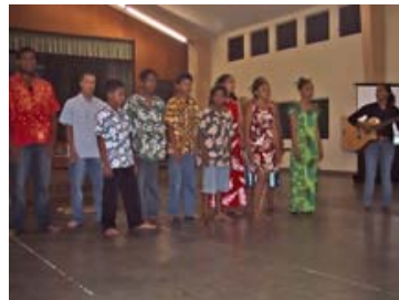
More performances from the students of Ke Ana La'ahana Public Charter School