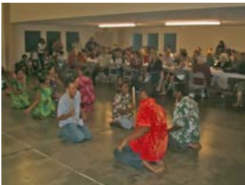
Students from the Ke Ana La'ahana Public Charter School perform for the audience