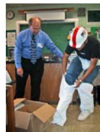
So you wanna be an astronaut? Student volunteer dons a mass absorption device before his low-budget spacesuit