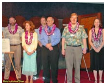
Visiting Journey Scientists assemble onstage for a brief photo opportunity