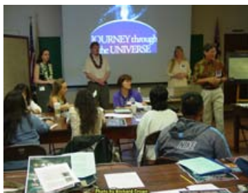
The master teacher training session involved 21 educators from Hilo-Laupahoehoe-Waiakea complex.

The second year of the Carl Sagan Center for Earth and Space Science Education sponsored Journey Through the Universe program on Hawaii Island. The program engages our community in sustained science, math and technology education in a celebration of human exploration: how we have come to know what we know about the Universe, and the joys of learning.